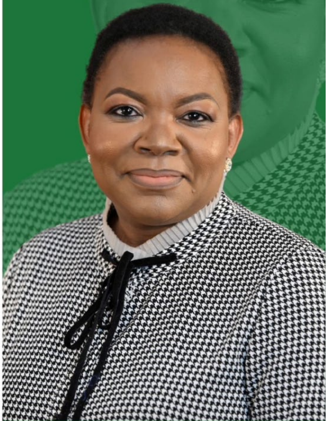
MEC Mavhungu Lerule-Ramakhanya: Budget Speech - Department of Education